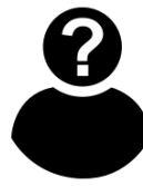
We need another co-chair for the access working group